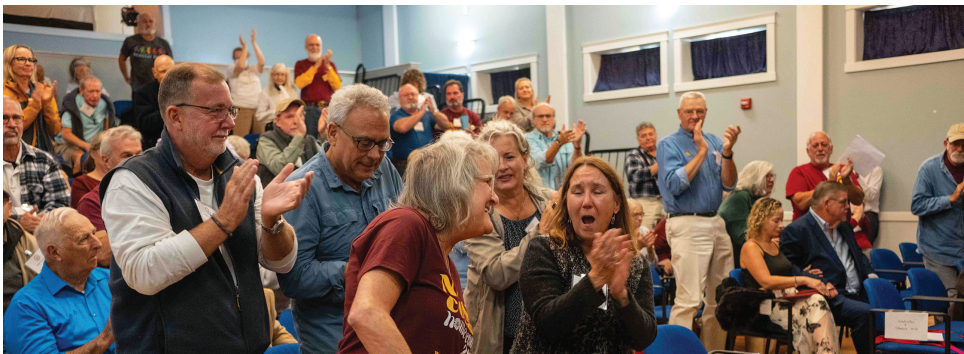
A happy and supportive crowd at graduation.