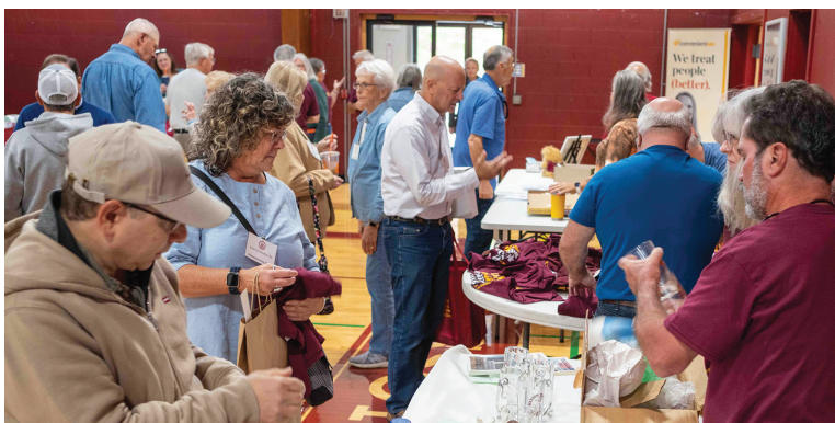
Shopping for Nasson College memorabilia.