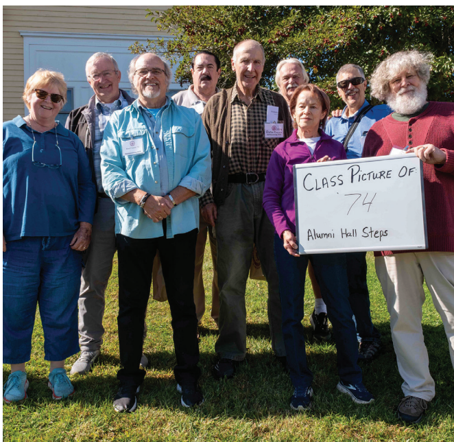
Alumni from the Class of 1974.