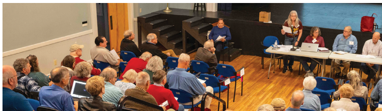
2024 Annual Meeting.