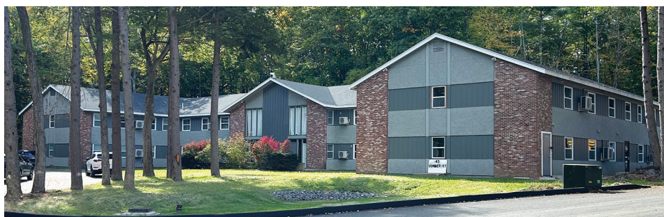
Repurposed buildings of Upper Campus.